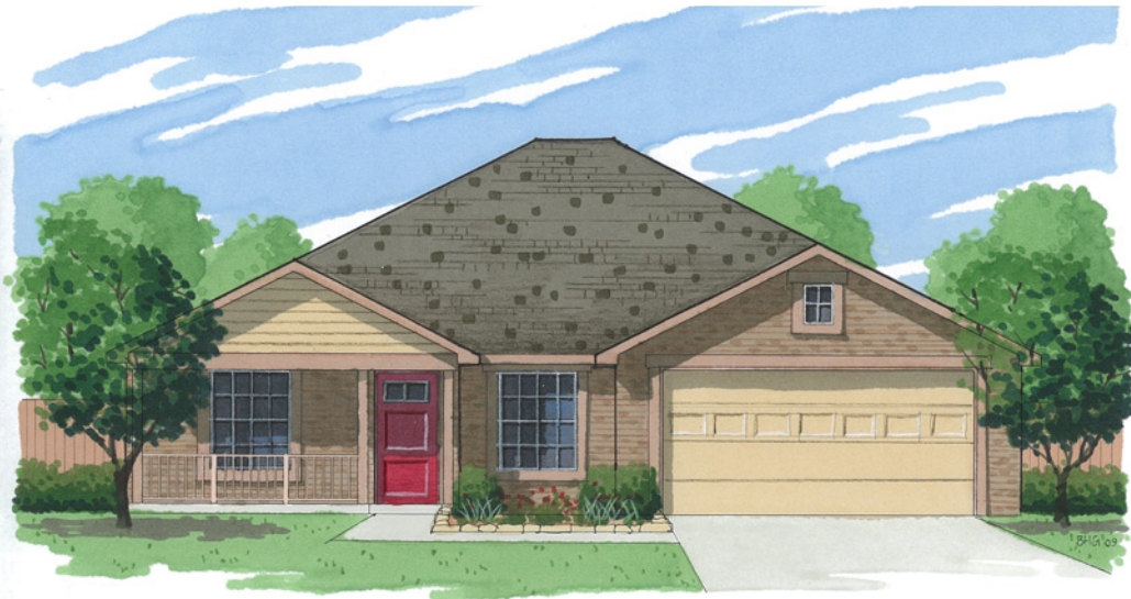
FRONT ELEVATION SCALE: 3/32"=1'-0"