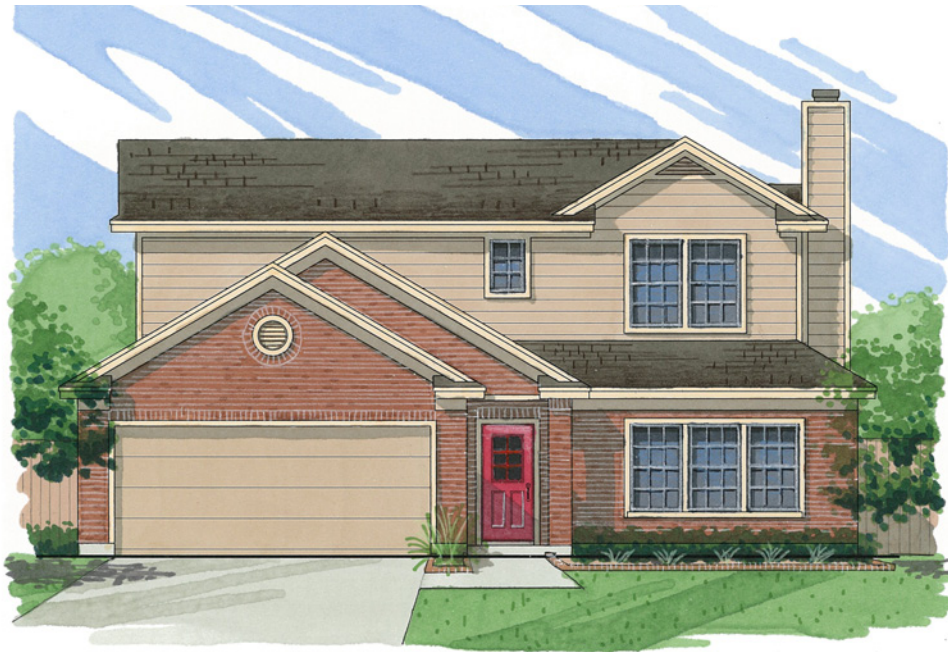
FRONT ELEVATION SCALE: 3/32"=1'-0"

ELEVATION ILLUSTRATED WITH OPTIONAL: ADDITIONAL LANDSCAPING