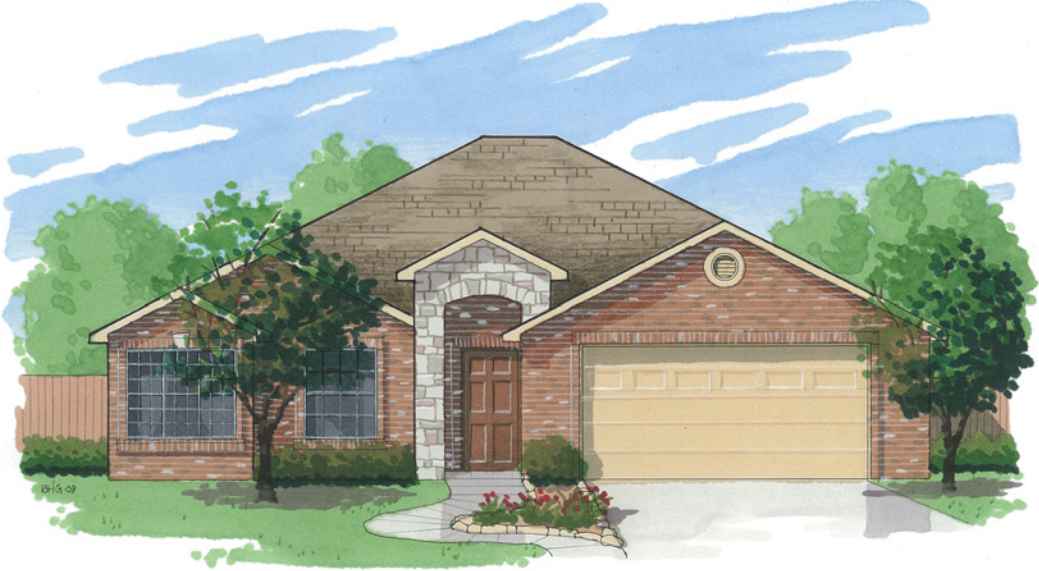
FRONT ELEVATION SCALE: 3/32"=1'-0"

ELEVATION ILLUSTRATED WITH OPTIONAL: BRICK GABLES STONE ARCHED ENTRY 6/12 ROOF PITCH ADDITIONAL LANDSCAPING